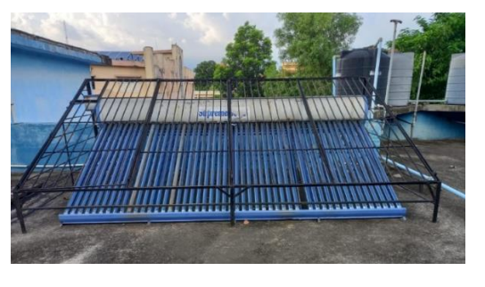
Fig: Solar heater

• Solar heater has been installed in hostel roof for student hostel.