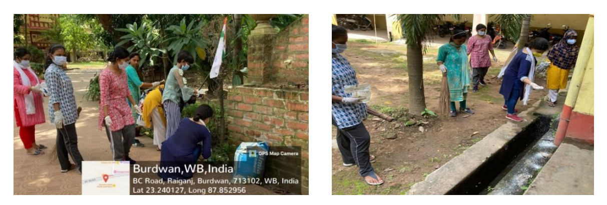
Fig: Initiative taken by students for green and clean campus