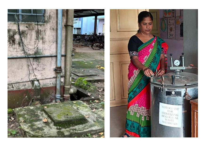
Fig: Activated charcoal pit and dedicated autoclave for pathogenetic waste material