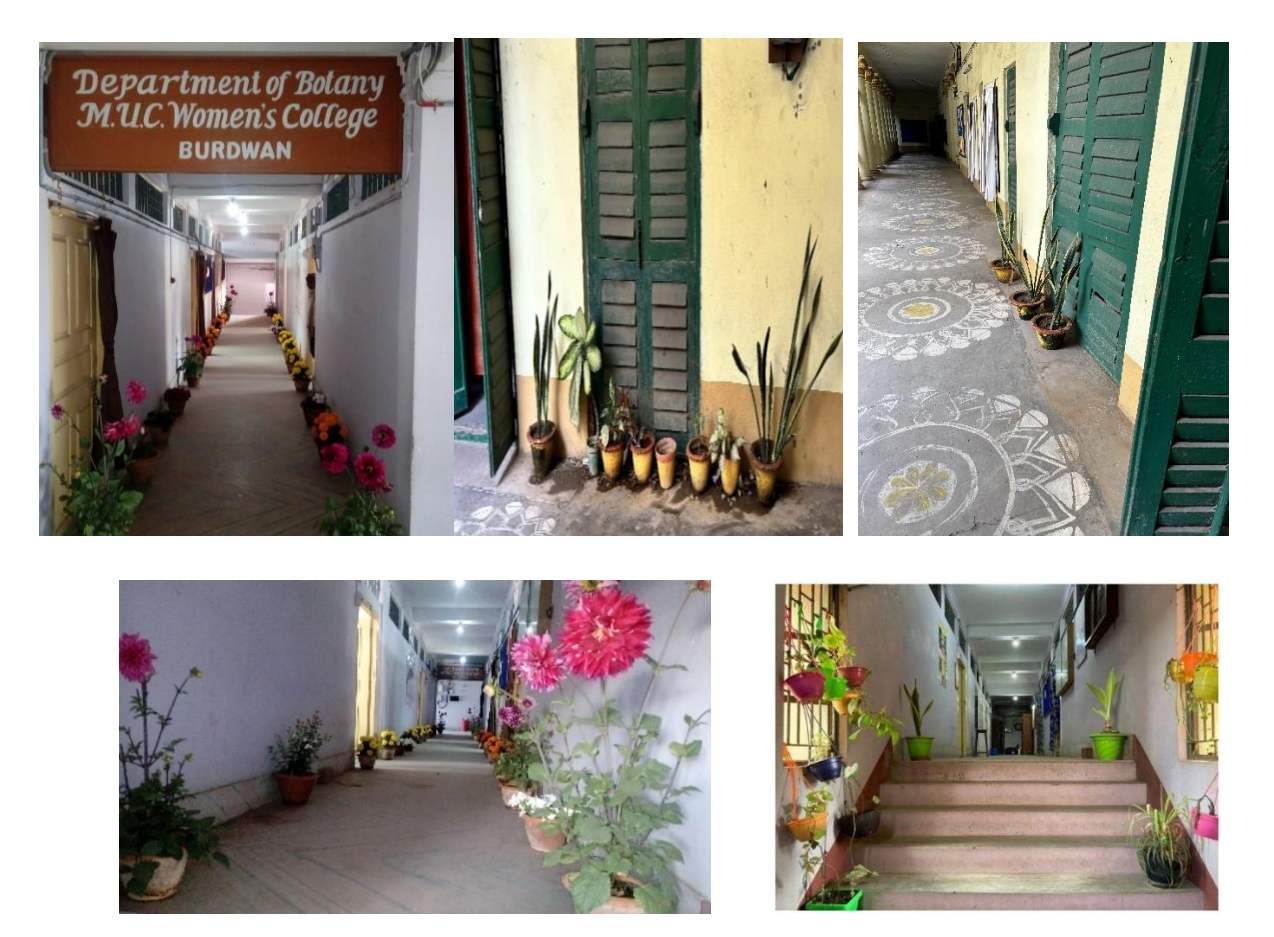
Fig: Green corridors and indoor plants improve air quality in campus buildings.

Well maintained garden with green play ground has added beauty to our college and boosts for the healthy & pollution free climate for everybody on the campus. Medicinal and plant garden has established in the college campus and hostel with proper maintenance by the gardener. Around 150 known and rare plant species are maintained in the college campus and medicinal garden with their labelling. In our college we are having huge green sprinklers for natural beauty. Hence, we are given name our campus as " Green Campus "