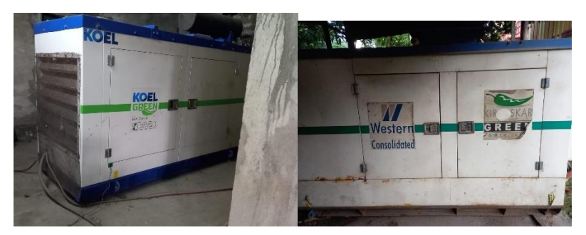
Fig: Green generator sound proof