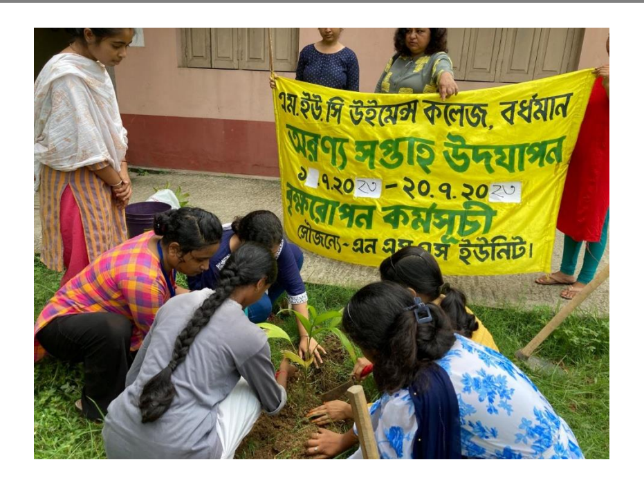
Fig: Botany Department Students' Plantation Program