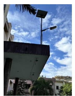
Fig: Solar street light

• Solar street light also installed in college premises.