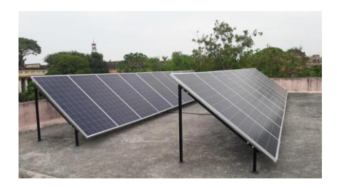
Fig: Solar panel installed in the rooftop

• Solar heater has been installed in hostel roof for student hostel.