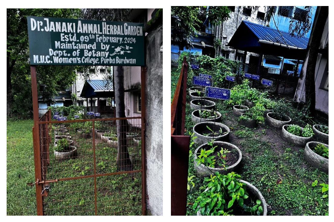
Fig: Herbal Garden

By incorporating a variety of important herbs, the garden serves as a living laboratory for students to explore and understand the properties and uses of herbal drugs. This hands-on approach not only enriches their theoretical knowledge but also offers practical insights into the world of herbal medicine.