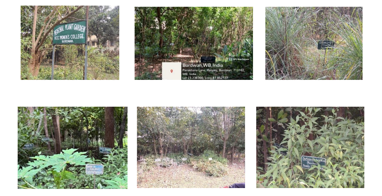
Fig: Medicinal plant garden of the plants

After a daylong survey, we have divided the college campus into different block. The following table shows different blocks along with the number of plant species and their local and scientific names.