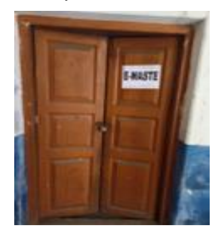
Fig: E-waste room