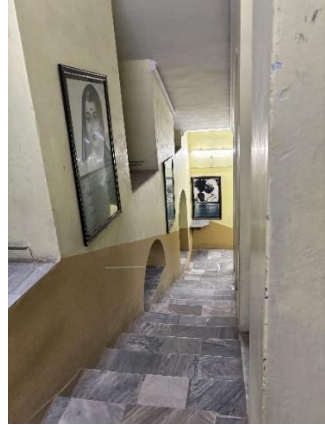
Fig: Good quantity of sunlight enters class room, laboratory, staircase, and corridor and some building areas not received ample sunlight.