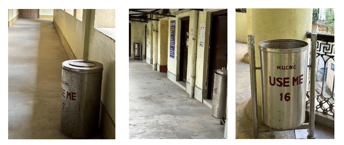
Fig: Use dust bin for solid waste